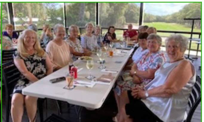
Ladies Committee Christmas luncheon at Bribie Golf Club with the Ladies Committee and volunteers