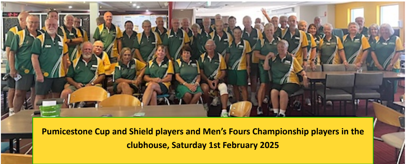
Pumicestone Cup and Shield players and Men's Fours Championship players in the clubhouse, Saturday 1st February 2025