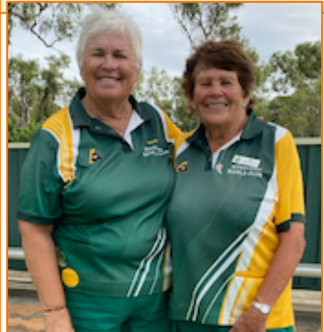
Ladies Pairs Champions 2026