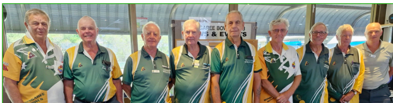
2026 Mens Committee