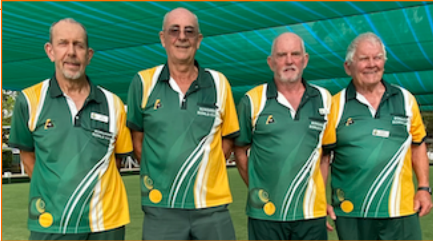
Mens 4s Champions 2026

Thank you must go to the umpires of the day and the bar staff who watered all after the game.