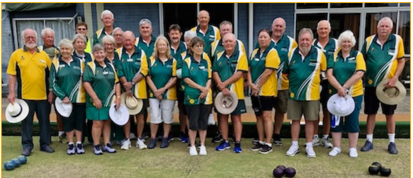
Beginners' Bash - the Bowlers, the Markers, the Scorecard Operator and the Umpire. January 2026